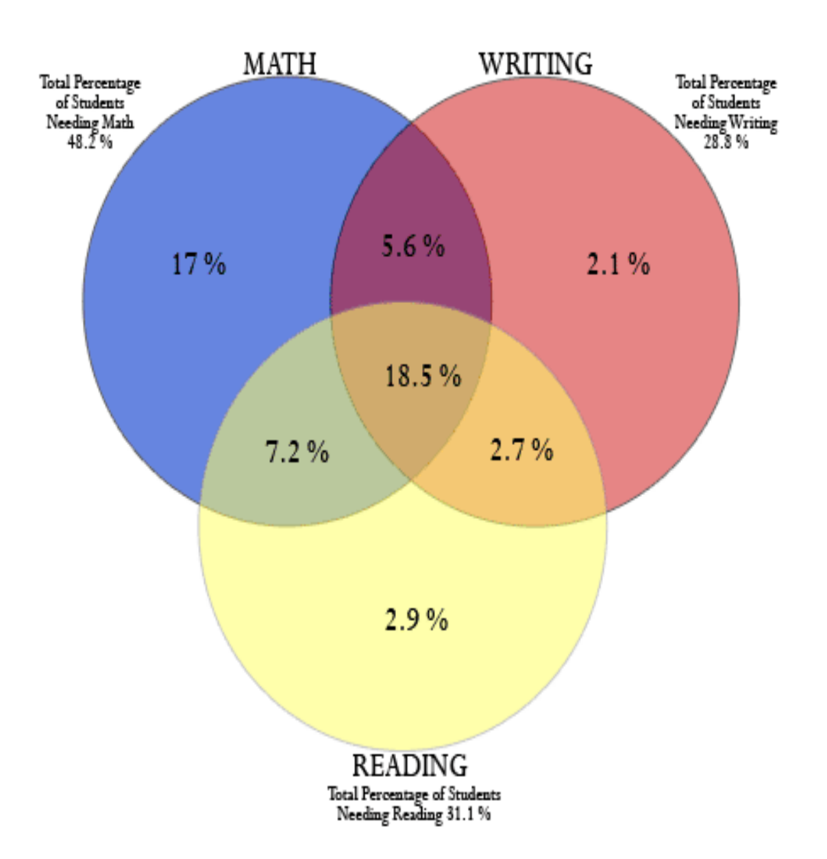
FIGURE 1: Recent High School Graduates Requiring Remediation Two Year Public